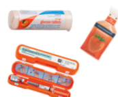
EXTRA GLUCOSE TABLETS, GEL & GLUCAGON