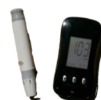
BACK UP SUPPLIES