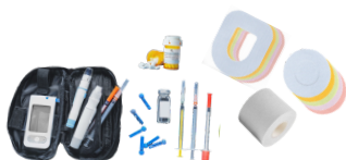
SUPPLIES FOR DURATION OF FLIGHT