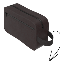
EXTRA SUPPLIES BAG