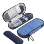
INSULIN COOLING CASE